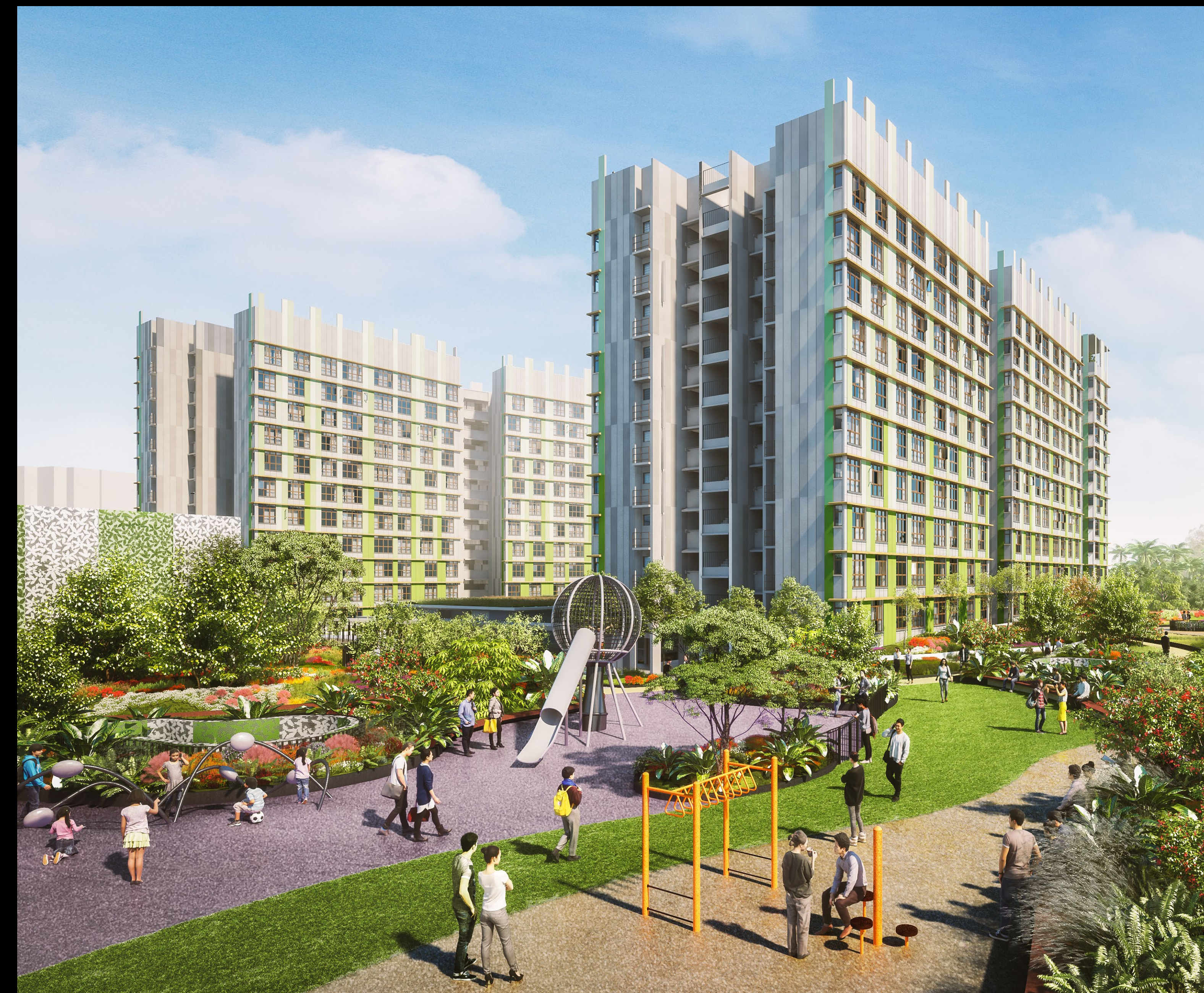
Environmental deck at 3 rd storey serves as communal space for mingling and various activities, offering unobstructed views of the scenic Bidadari Park and Alkaff Lake, creating a serene and picturesque setting for residents and visitors alike

Designed to be an integrated residential, transport and food hub, this housing development is linked to a bus interchange, hawker centre and Woodleigh MRT station. The name Woodleigh Village brings to mind a closely knitted community where a myriad of activities and exchanges takes place