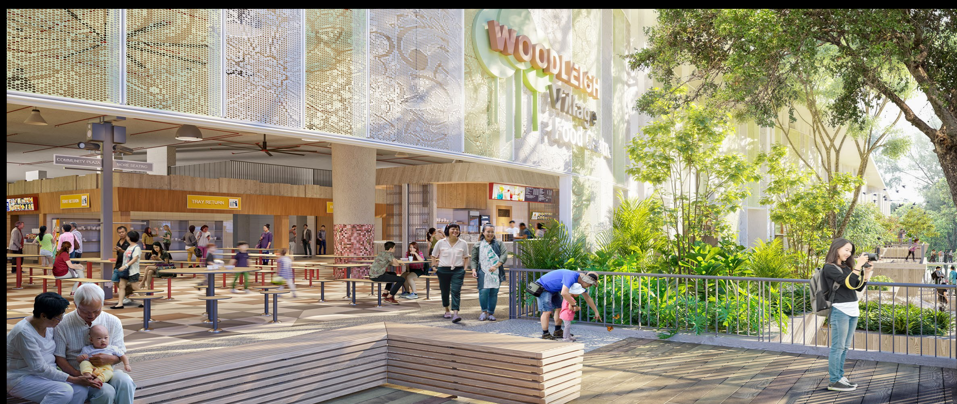
Hawker centre infused with natural daylight and a breezy ambience, providing diners with a delightful picnic-like dining experience

Hybrid top-down and bottom up construction was adopted to speed up the basement construction works